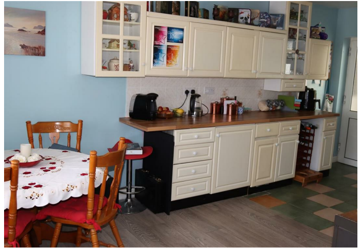
Open Plan Dining/Kitchen