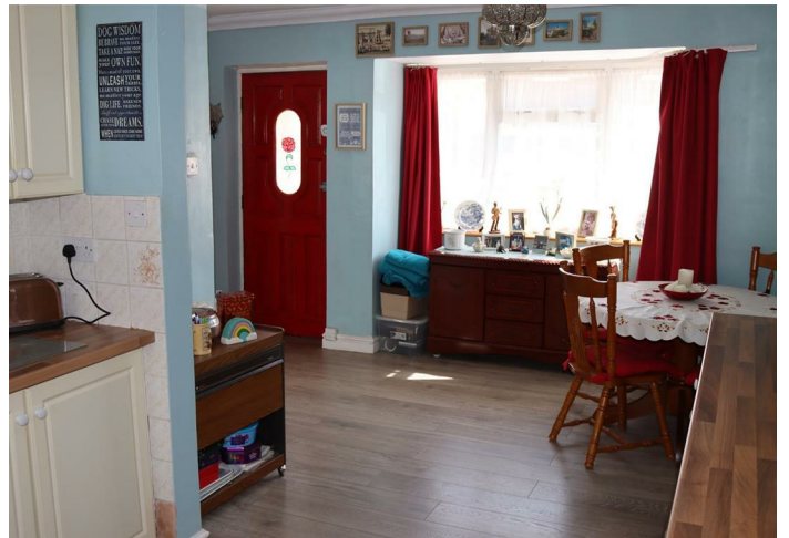
Open Plan Dining/Kitchen